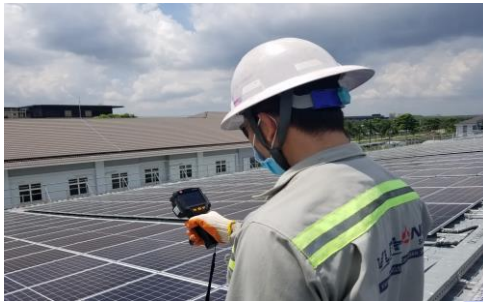
Check hotspot on PV panel