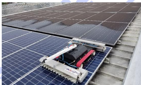
PV cleaning robot